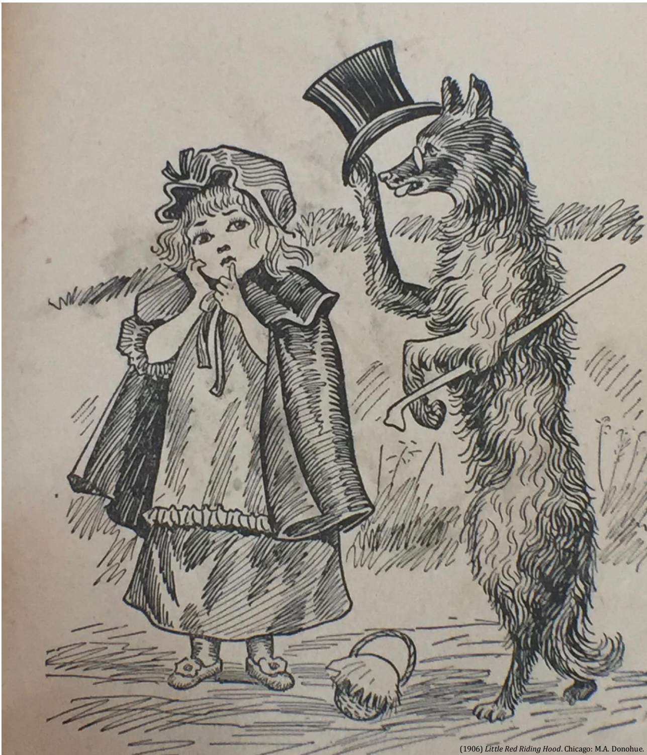
(1906) Little Red Riding Hood . Chicago: M.A. Donohue.